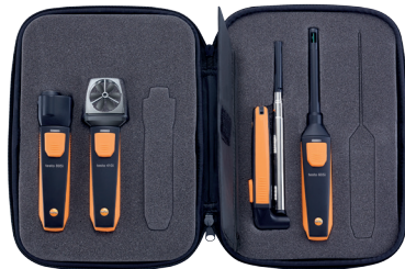
VAC Smart Probe Kit: 0563 0003