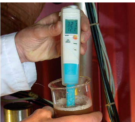
testo 206-pH1 is ideal for measurements in liquids