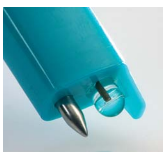
pH1 probe head for liquids