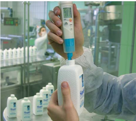
Automatic full scale value recognition and clear 2 line display.