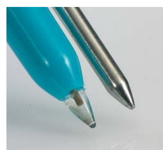
pH2 probe head for semisolid substances