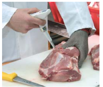
Fast and convenient measurement during production