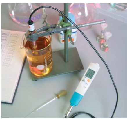
testo 206-pH3 faciltates the connection of external pH probes