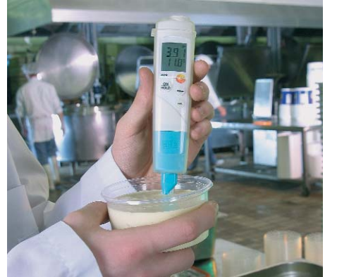
testo 206-pH2 is ideal for measurements in viscoplastic substances.