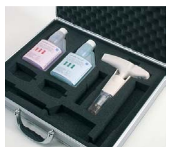
Set case with testo 205, pH 4.0 and 7.0 buffers as well as storage cap