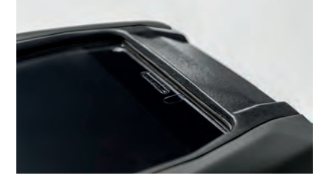
Secure mounting 4 strong magnets with rubber coating – particularly material friendly.

Scratch-resistant, recessed and with a special replaceable protective film.