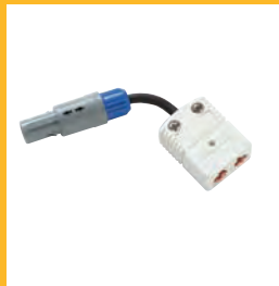
Universal Thermocouple Adapter