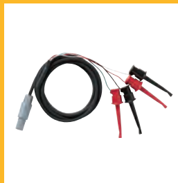
Universal RTD Adapter