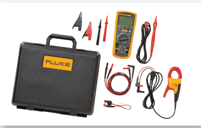
Fluke 1587 FC ET Advanced Electrical Troubleshooting Kit

Establishing preventative maintenance programs are becoming critical to maintaining the uptime of electrical equipment and can significantly reduce both planned and unplanned downtime. Unplanned downtime costs are difficult to calculate, but often significant. For some industries, it can represent 1 % to 3 % of revenue (potentially 30 % to 40 % of profits) annually.