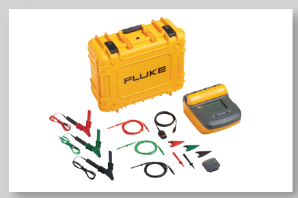
Fluke 1550C FC Insulation Resistance Tester Kit