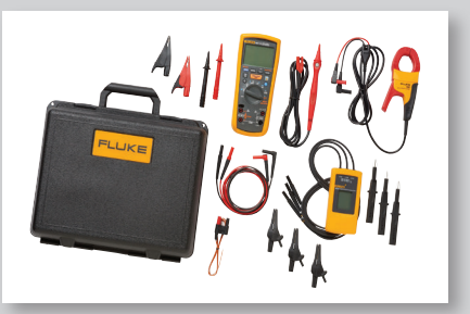
MDT Advanced Motor and Drive Troubleshooting Kit