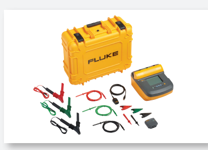
Fluke 1555 FC Insulation Resistance Tester Kit