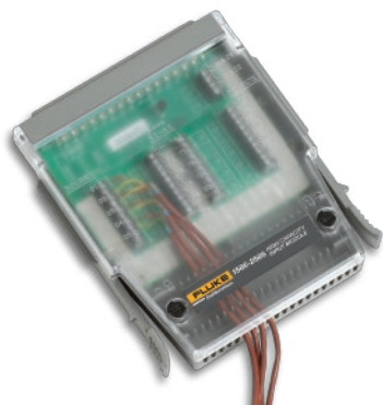
1586-2586 High-Capacity Module Universal input channels accepts 2-, 3-, or 4-wire connections to measure temperature, resistance, dc voltage, and dc current for

For a calibration lab where accuracy is of primary importance, the Super-DAQ is best configured with a DAQ-STAQ Multiplexer. The external DAQ-STAQ features mini-jack thermocouple terminals—each with its own reference junction sensor—and patented mini-DWF, gold-plated input terminals, which accept bare wire, spade lug, or mini-banana-plug probe terminations. Easily connect and disconnect PRTs, thermistors, and thermocouples for benchtop temperature calibration. It can be stacked on the 1586A to reduce footprint in busy labs. Having the flexibility to configure the Super-DAQ for factory or lab use reduces your equipment needs and cost.