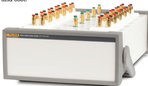
1586-2588 DAQ-STAQ Multiplexer Designed for high-accuracy measurements in secondary temperature calibration labs. Easily connect/disconnect thermocouples, PRTs, and