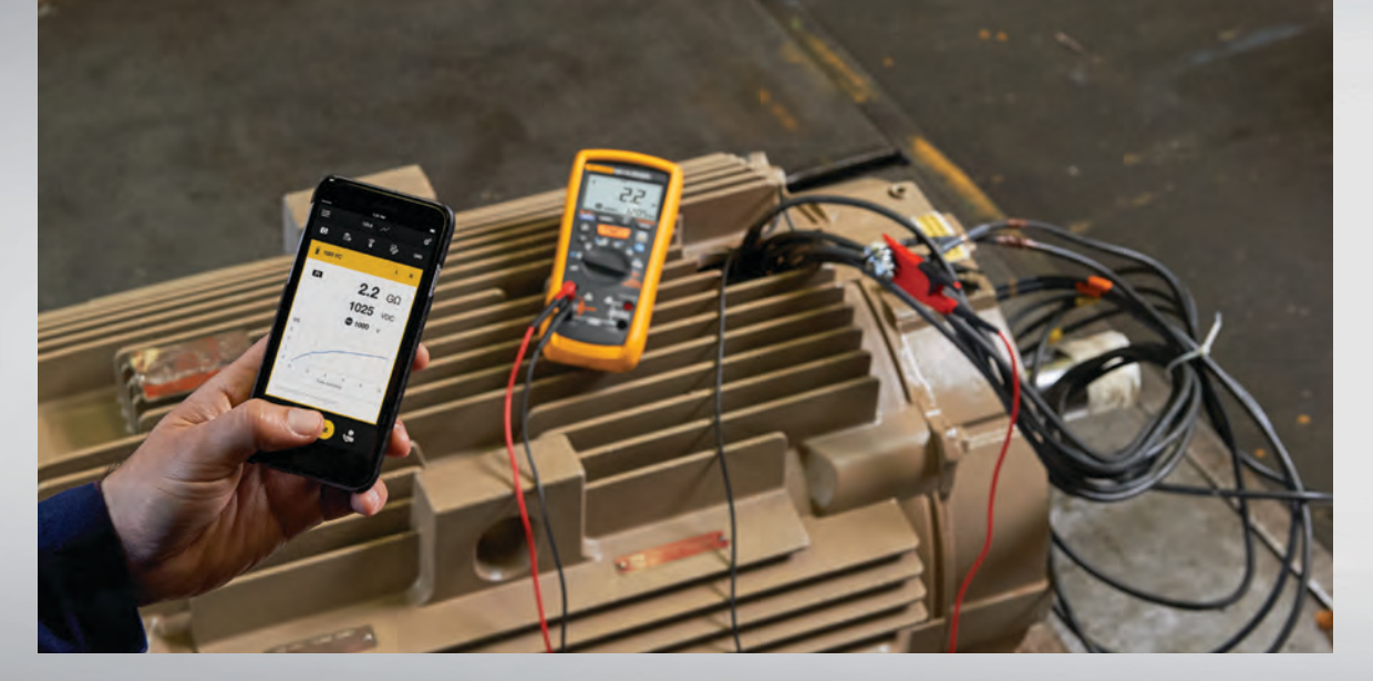
A digital insulation tester and full-featured multimeter—TWO TOOLS IN ONE!