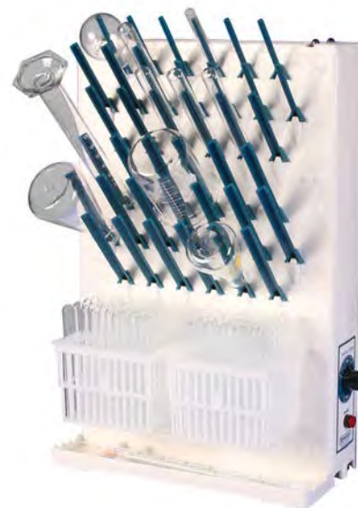
Benchtop - Electric Single-sided, 3 tier