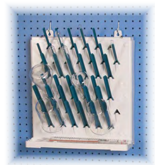
Wallmount - Non-electric Single-sided, 2 tier