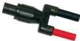
Banana (female) - BNC (male) Adaptor Catalog #2118.46 (optional)

**Available as special orders only. Contact customer service for current list price.