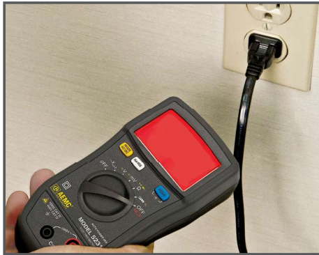
Non-contact detection of network voltage (NCV Function-AC only)