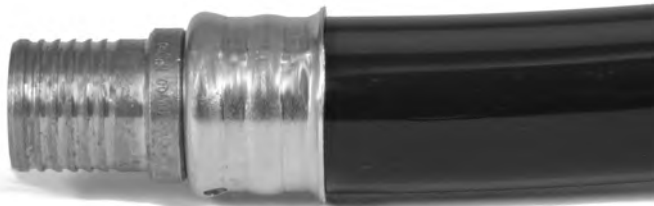
Figure 3 – Completed Pressed Fitting

PureFlow® is a registered trademark of Viega®. Viega® is a registered trademark of Franz Viegeler II GmbH & Company