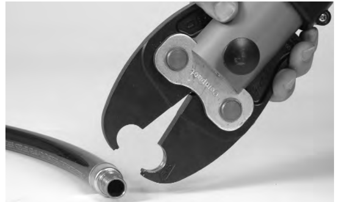
Figure 1 – Opening The Jaw