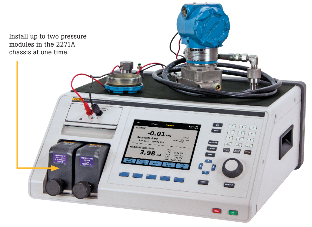
Use the 2271A to perform closed loop, fully automated calibration on 4-20 mA devices like this transmitter.

The 2271A accuracy specifications are provided in full and supported by a technical note that details its measurement uncertainty so you know exactly what you are getting. This technical note is available for download on the flukecal.com website. As with all Fluke Calibration instruments, these specifications are conservative, complete and dependable.