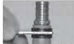
Figure 1 – Hold Gauge Perpendicular To Tube and Slide Over Ring