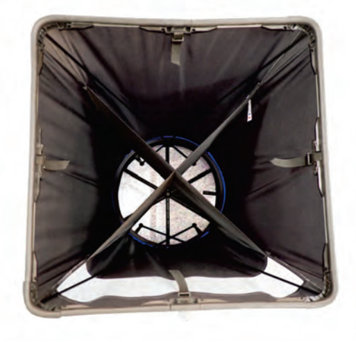
Hood with flow straightener