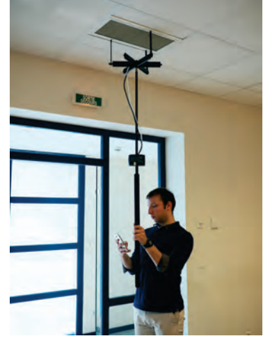
Use with the measurement grid