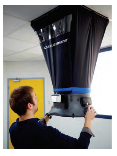
Use of the air flow meter