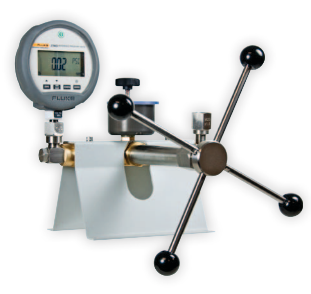
Combine the 2700G gauge with the P5510, P5513, P5514 (shown here) or P5515 Comparison Test Pumps for a complete bench top pressure calibration solution.

The 2700G Reference Pressure Gauges provide best-in-class measurement performance in a rugged, easy-to-use, economical package. Improved measurement accuracy allows it to be used for a wide variety of applications. It is ideal for calibrating pressure measurement devices such as pressure gauges, transmitters, transducers, and switches. In addition, it can be used as a check standard or to provide process measurements with data logging.