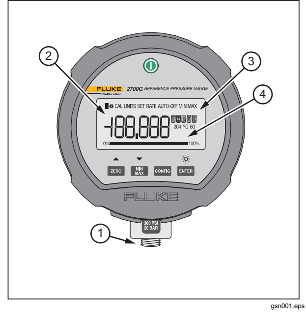
Figure 1. The Product

The Display and Buttons are shown in Figure 1. The Buttons are in Table 2.