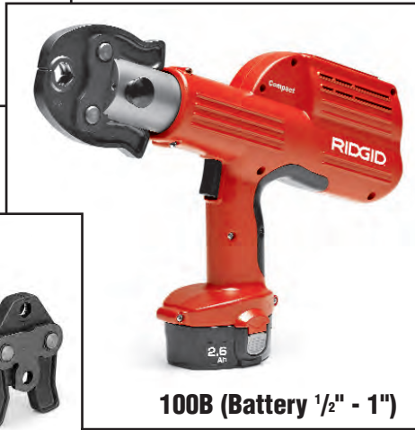
100B (Battery 1/2" - 1")