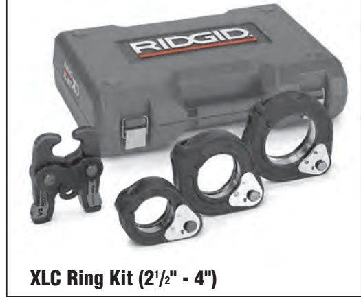
XLC Ring Kit (2 1/2" - 4")