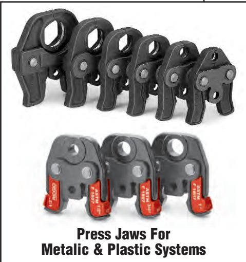
Press Jaws For Metalic & Plastic Systems