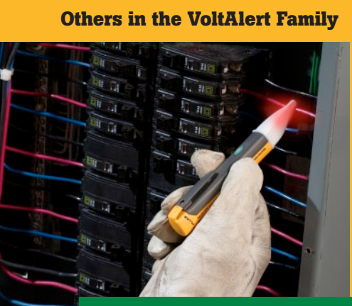
1AC-II with beeper, on-off and self test