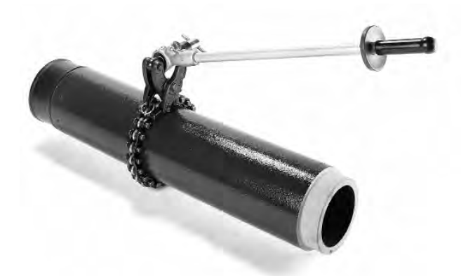
Figure 2 - 206/246 Soil Pipe Cutter

The RIDGID 206 and 246 Soil Pipe Cutters utilize an integral ratchet handle centered on the pipe. This is especially useful when cutting pipe in trenches, and helps keep the width of the trench to a minimum. Both use a unique hooking mechanism to make hooking the chain easier. The 206 uses the same chain as the 226 and 276, while the chain on the 246 is larger and allows it to cut 4" class 22 water main and 2" - 5" extra heavy duty soil pipe.