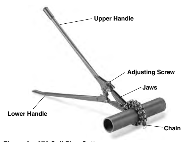
Figure 6 – 276 Soil Pipe Cutter

Once the 276 Soil Pipe Cutter is adjusted for a given size of pipe, it usually requires no further adjustment for subsequent cuts.