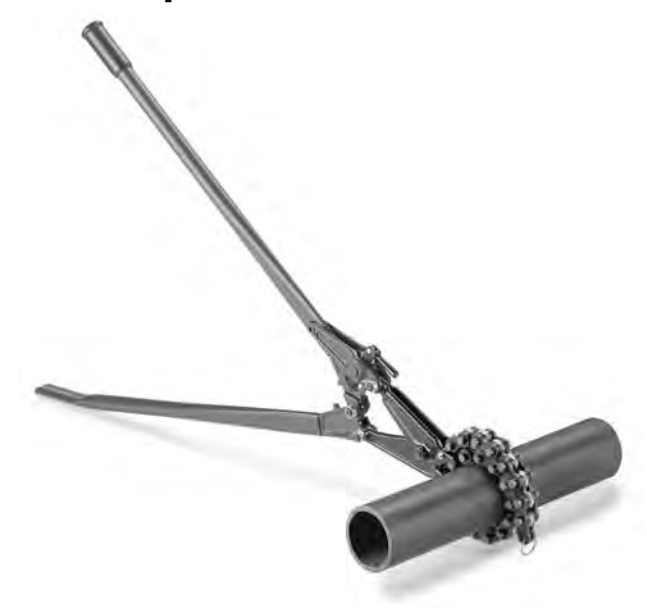
Figure 3 – 276 Soil Pipe Cutter

The RIDGID 276 Soil Pipe Cutter is designed to allow soil pipe to be cut in a single stroke. This allows repeated cuts to be made quickly.