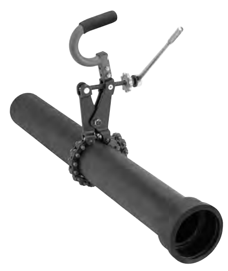
Figure 1 - 226 Soil Pipe Cutter

The RIDGID 226 In-Place Soil Pipe Cutter is a compact tool (17" long) designed to cut hub and no-hub soil pipe, especially where space is limited. The handle is removable to allow use in tight spaces. The feedscrew is equipped with a hand knob for fast adjustment, and a 15" long 1/2" drive ratchet is supplied for operation. If needed, the 226 can also be operated with any 1/2" drive ratchet or 15/16" wrench. The 226 uses a unique hooking mechanism to make hooking the chain easier.