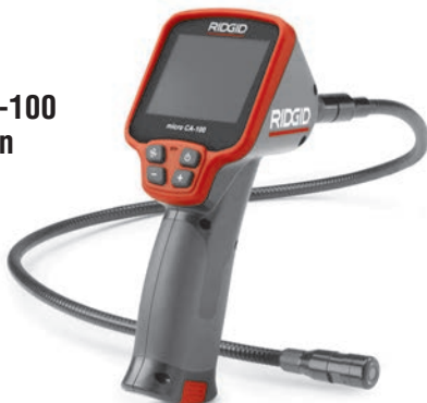
micro CA-100 Inspection Camera