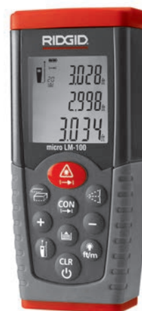
micro LM-100 Laser Distance Meter