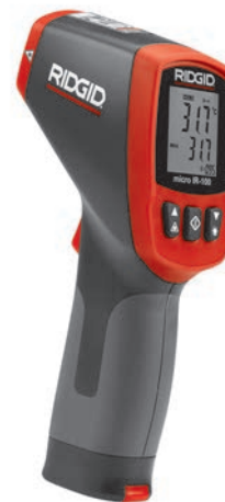
micro IR-100 Non-Contact Infrared Thermometer

For the complete selection of the RIDGID product line, please refer to the Ridge Tool Catalog or www.RIDGID.com .