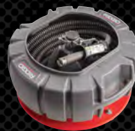
SECTIONAL CABLE CARRIER Cat. # 61708

The new sectional cable carrier lets you transport cables in and out of the jobsite faster and cleaner. A sturdy base keeps the carrier secure, so you can spin sectional cables in or out of the housing unit efficiently. The carrier keeps soiled cables contained to mitigate jobsite contamination.