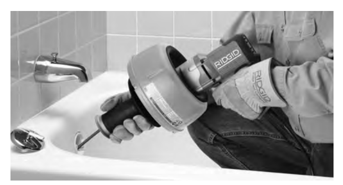
Figure 9 - Push Cable Down Drain Line