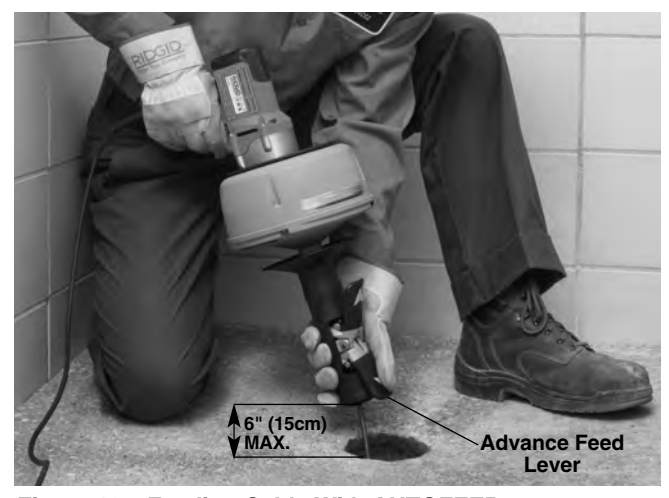
Figure 10 - Feeding Cable With AUTOFEED

Confirm that at least 12" (30cm) of cable is in the drain and that the cable outlet of the drain cleaner is no more than 6" (15cm) from the drain opening. Move the handgrip away from drum to disengage the chuck from the cable. Do not engage the chuck while using the AUTOFEED. Press the ON/OFF switch to start the machine. To advance the cable into the drain, depress the advance feed lever. The rotating cable will work its way into the drain. Do not allow the cable to build up outside the drain, bow or curve. This can allow the cable to twist, kink or break.