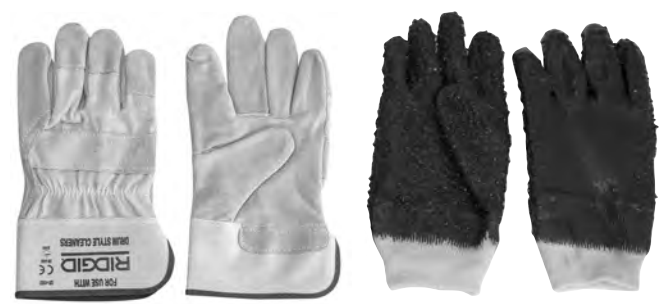
Figure 4 - RIDGID Drain Cleaning Gloves - Leather, PVC

Inspect the RIDGID drain cleaning gloves. Make sure they are in good condition with no holes, tears or loose sections that could be caught in the rotating cable. It is important not to wear improper or damaged gloves. The gloves protect your hands from the rotating cable. If the gloves are not RIDGID drain cleaning gloves or are damaged, worn out or do not fit snugly, do not use machine until RIDGID drain cleaning gloves are available. See Figure 4.