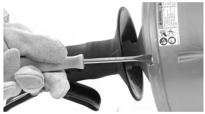
Figure 13 – Loosen 4 Drum Screws About 3 Full Turns, But Do Not Remove

3. Separate the drum front from the drum back by holding the drum back and twisting the drum front counter clockwise. ( Figure 14 ).