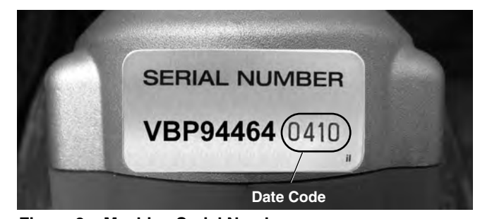
Figure 3 - Machine Serial Number

The machine serial number is located on the underside of the power unit. The last 4 digits indicates the month and year of the manufacture. (04 = month, 10 = year).