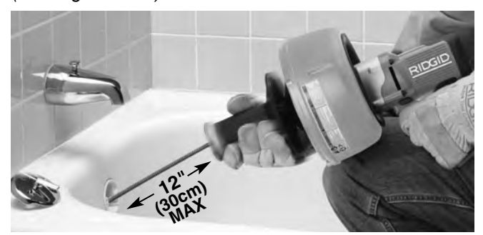
Figure 8 – Move Hand Grip Toward Drum To Grip Cable With Chuck

As feeding the cable becomes more difficult, the chuck can be used to better grip and feed the cable. Move the handgrip towards the drum to grip the cable with the chuck. With the cable rotating (ON/OFF switch ON) move the drain cleaner towards the drain opening to push the cable down the drain. Release the ON/OFF switch. Move the handgrip away from the drum to release the chuck from the cable. Grip the cable with your gloved hand to prevent it from pulling out of the drain and pull the drain cleaner back so that no more than 12" (30cm) of cable is exposed. Repeat the above steps to continue advancing the cable in this manner. (See Figures 8-9.)