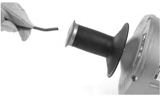
Figure 17 – Loading Cable Without Changing Inner