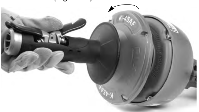
Figure 14 - Twist Drum Apart

3. Separate the drum front from the drum back by holding the drum back and twisting the drum front counter clockwise. ( Figure 14 ).