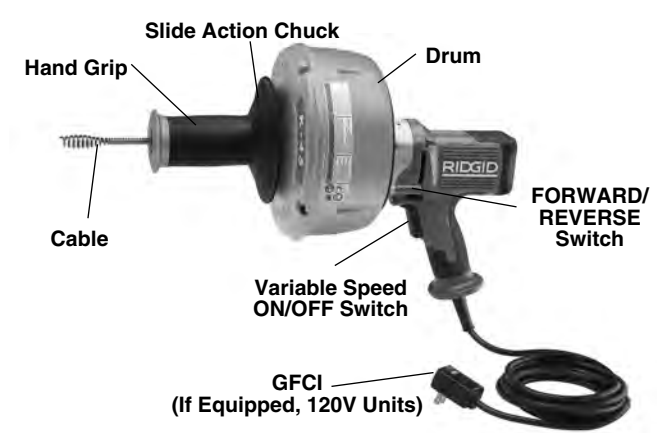
Figure 1 – K-45 Drain Cleaning Machine With Slide Action Chuck

See Accessories section for a listing of available cables and lengths.