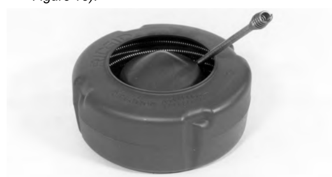
Figure 16 – When Loading Cable Into An Inner Drum, Coil The Cable CLOCKWISE.

4. Coil the cable into the inner drum CLOCKWISE (See Figure 16).