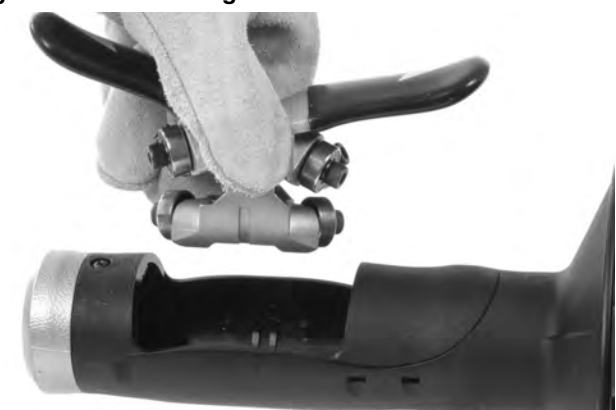
Figure 12B – Removing AUTOFEED Mechanism From Housing