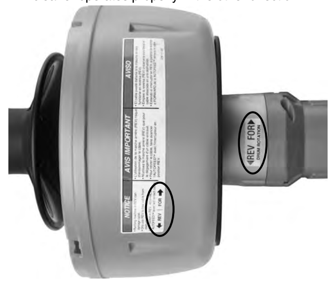
Figure 5 - FOR/REV Labels

and repeat above testing to confirm that the drain cleaner operates properly in the other direction.