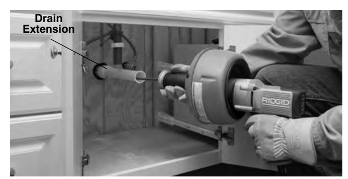
Figure 6 - Example Of Extending Drain To Within 6" (15cm) Of Drum Opening