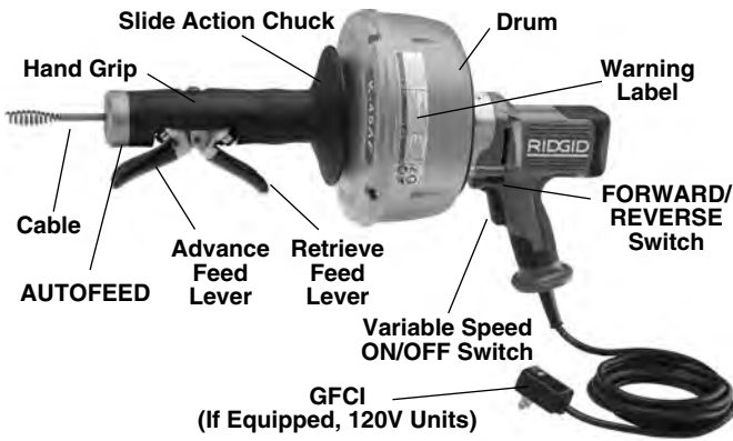
Figure 2 – K-45 AF Drain Cleaning Machine With AUTO-FEED