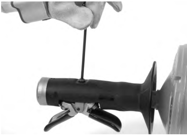
Figure 12A - Removing AUTOFEED Screw