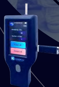
Sleek/Modern Instrument Design