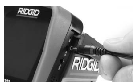
Figure 7 – Powering the Unit with AC Adapter