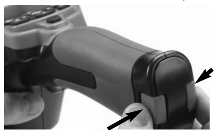
Figure 5 – Battery Compartment Cover

Squeeze the battery clips (See Figure 5) and pull to remove battery compartment cover. If needed, slide battery out.