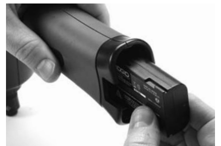
Figure 6 – Removing/Installing Battery