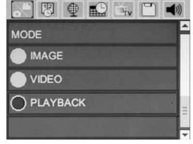
Figure 18 – Settings Screen

While in menu mode, you can press the Return button <u>to return to the previous screen or to the live screen</u>.