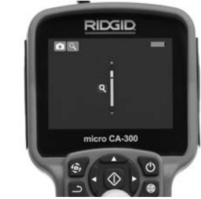
Figure 16 – Adjusting Zoom

Zoom : The micro CA-300 Inspection Camera has a 2.0x digital zoom. Simply press the up and down arrows ▲ ▼ while in the live screen to zoom in or out. A zoom indicator bar will be displayed on the screen as you adjust your zoom.