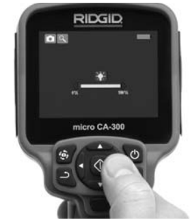
Figure 15 – Adjusting LED

Adjust LED Brightness : Pressing the right and left arrow button ➤ < on the button pad (In live screen) will increase or decrease the LED brightness. A brightness indicator bar will be displayed on the screen as you adjust brightness.