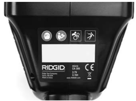
Figure 11 – Warning Label