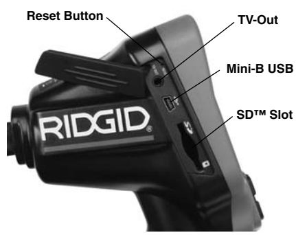
Figure 4 – Left Side Port Cover