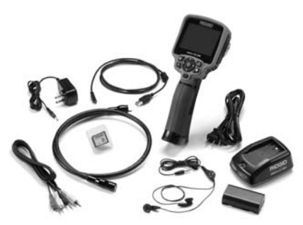
Figure 1 – micro CA-300 Inspection Camera