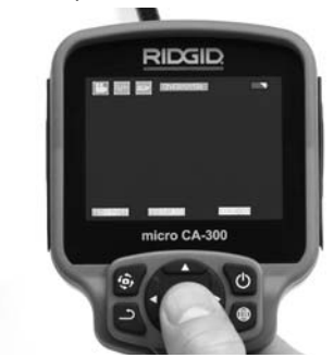
Figure 17 – Video Recording Screen

When the inspection is complete, carefully withdraw the camera and cable from the inspection area.