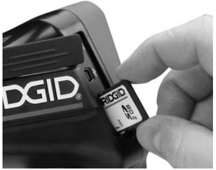
Figure 10 – Inserting the SD Card

Open the left side port cover ( Figure 4 ) to access the SD card slot. Insert the SD card into the slot making sure the contacts are facing towards you and the angled portion of the card is facing down ( Figure 10 ). SD cards can only be installed one way – do not force. When an SD card is installed, a small SD card icon will appear in the upper left hand portion of the screen, along with the number of images or length of video that can be stored on the SD card.