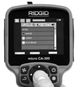
Figure 14 – Screen Shot of Mode Selection

Pressing the menu button at any time will access the menu. The menu will overlay on the LIVE Screen. Use the right and left arrow >< buttons to switch to the MODE category. Use the up and down arrows AY to navigate between menu items and press select 🕜 as desired.