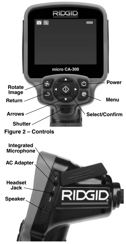
Figure 3 – Right Side Port Cover