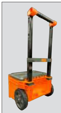
STEP 3 P