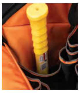
Large pocket fits a hammer with a 16" handle - Up to 6 lbs (2.7 kg)