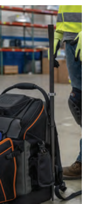
Fits a 24" to 36" connecting bar