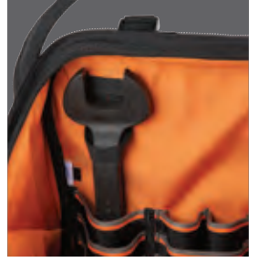
Custom straps hold 18" spud wrenches