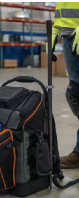
Fits a 24" to 36" connecting bar