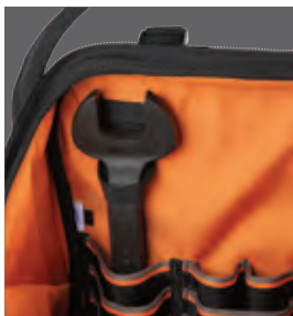
Custom straps hold 18" spud wrenches