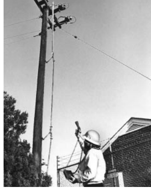
The detector is excellent for patrolling pole lines.