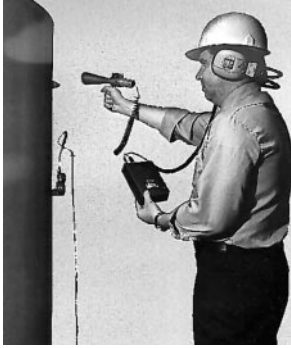
Locating a leak in an air pressure tank