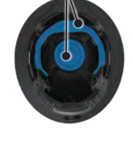
Patent-pending Accessory Mounts ensure a Klein® Headlamp is properly positioned -on front or back; NO STRAP needed!