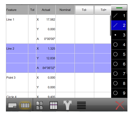
Reports Flexibility for report contents and formatting allows for full customization of the data format, header information, and header and footer graphics.

Measure features, set nominals, apply tolerances and view deviation results with only a few quick clicks.