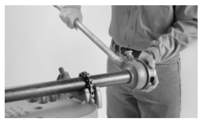
Figure 3 - Sliding Threader On Pipe

A WARNING Make sure the handle is clean and free from oil and grease. This allows for better control of the tool.