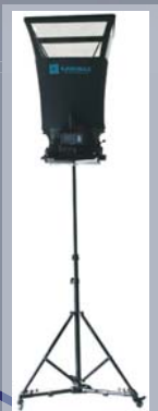
New portable stand: extends up to 6.9' from top to base