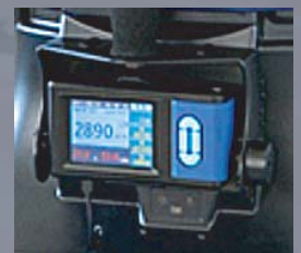
Full color backlit LCD tilts to be viewable from any on-leg