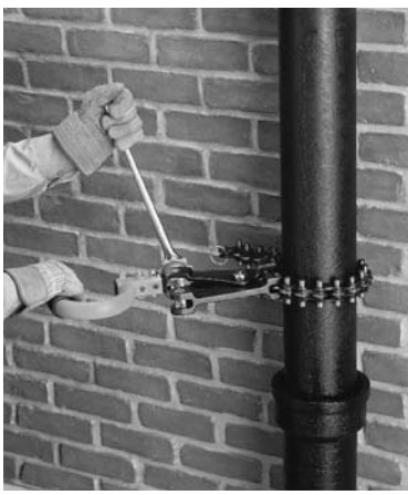
Cutting pipe in close quarters