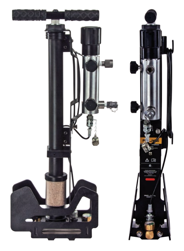
The 700HPPK features collapsible feet that make it easy to pack away.