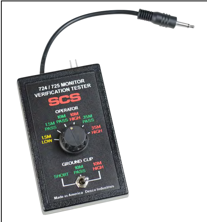
Figure 1. SCS 770065 Verification Tester