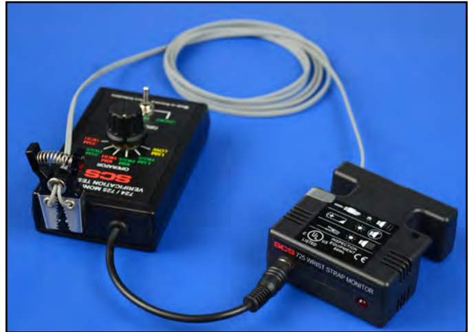
Figure 4. Using the Verification Tester with the 725 Portable Wrist Strap Monitor