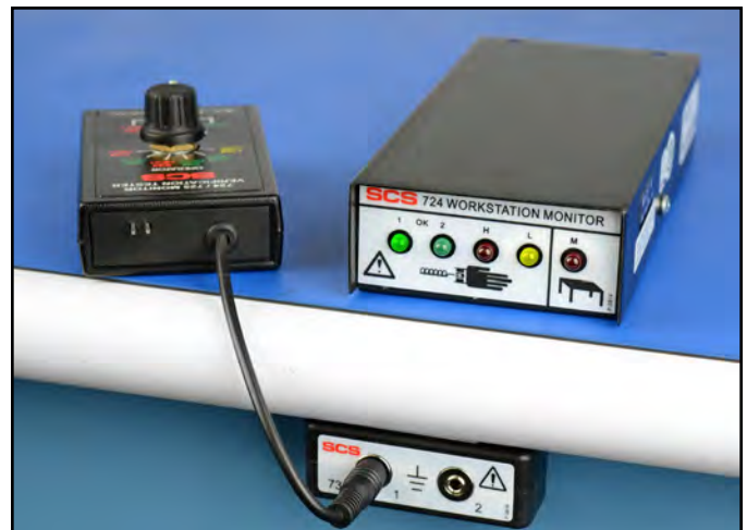
Figure 3. Using the Verification Tester with the 724 Workstation Monitor