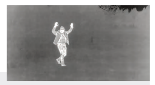
SUPERIOR THERMAL DETECTION Sharp, 60 Hz thermal imaging powered by the breakthrough FLIR Boson<sup>™</sup> thermal core

High-performance thermal lenses ranging from 14-36 mm offer a choice between quick, closeproximity detection and fine-tuned, long-range surveillance. When the mission demands reliable vision from a distance, premium Scion lenses can detect targets up to 1420 m away. 25 mm and 36 mm Scion optics leverage a manual focus ring to achieve a new level of clarity among FLIR thermal monoculars.