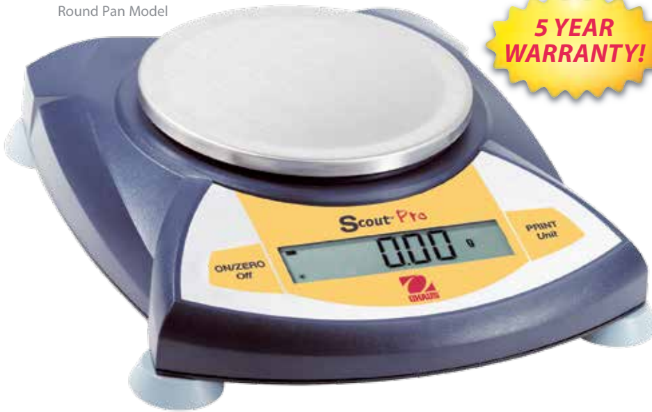
Round Pan Model