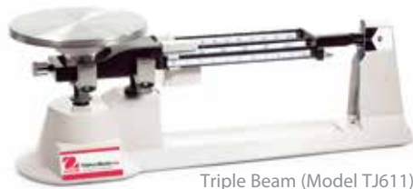
Triple Beam (Model TJ611) 3 Year Warranty

CHOOSE THE OHAUS TRIPLE BEAM THAT'S RIGHT FOR YOUR CLASSROOM