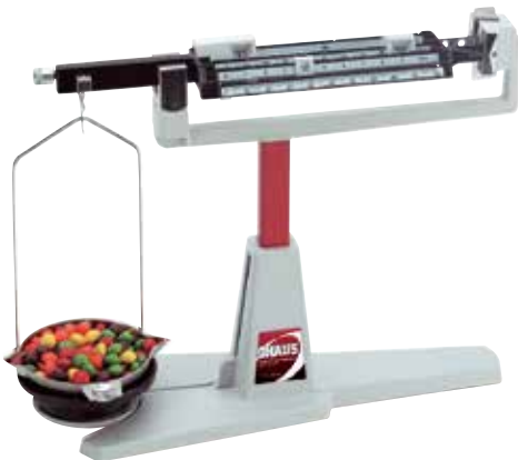
Cent-O-Gram United States Patent and Trademark Office Design Trademark Registration # 1,437,797