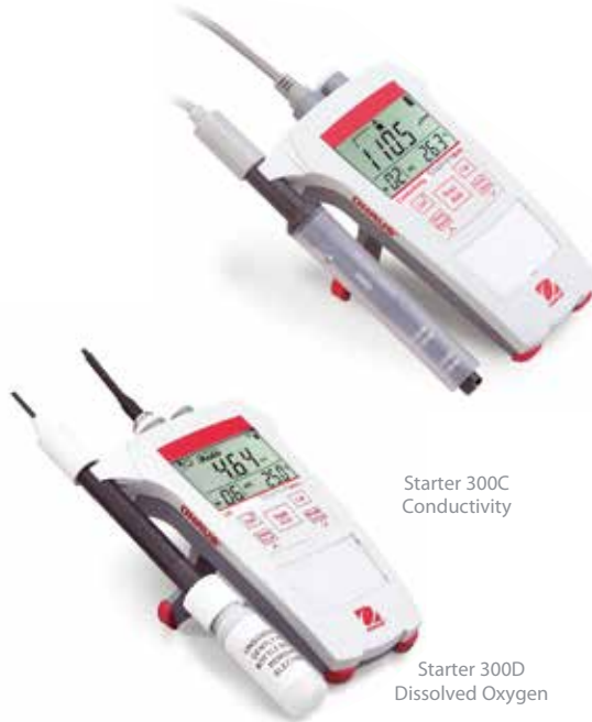
Starter 300C Conductivity

Versatile and Portable Meters for Wherever Your Lessons Take You