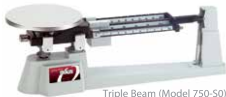
Triple Beam (Model 750-S0) 5 Year Warranty