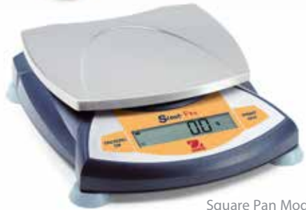
Square Pan Model