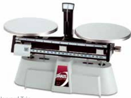
Harvard Trip United States Patent and Trademark Office Design Trademark Registration Number 1,439,006 (Registered 1,437,111 with dial)