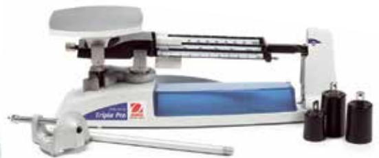
Triple Pro (Model TP2611) 10 Year Warranty