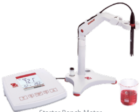
Starter Bench Meter