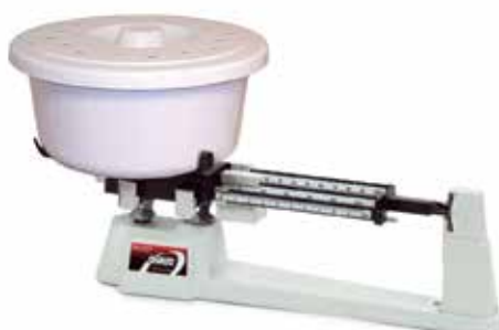
Triple Beam with Animal Container (Model 730-00)