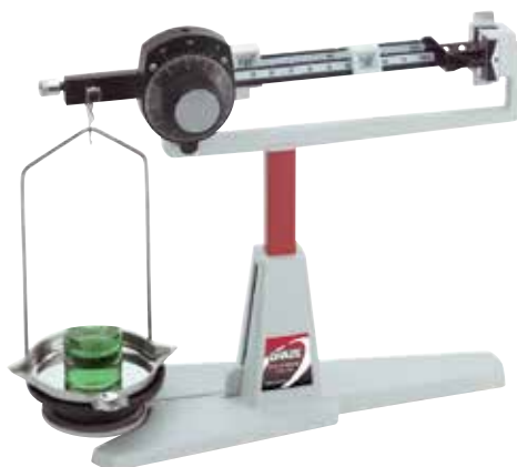
Dial-O-Gram United States Patent and Trademark Office Design Trademark Registration # 1,436,267

Self-aligning with beam design and special floating agate bearings, counterbalancing knob provides quick zeroing and stays in position, magnetic damping for quicker results, durable with aluminum pressure casting for the base and beam assembly, removable stainless steel pan.