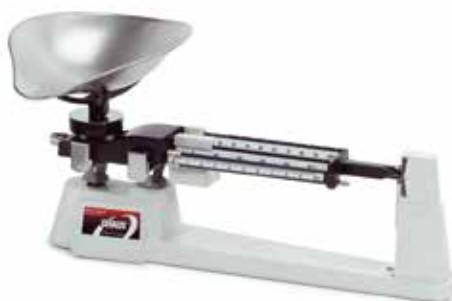
Triple Beam with Stainless Steel Scoop (Model 720-S0)