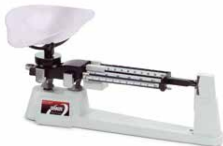
Triple Beam with Polypropylene Scoop (Model 720-00)