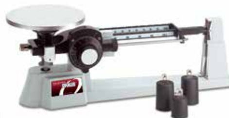
Dial-O-Gram® with Attachment Masses (Model 1650-W0)