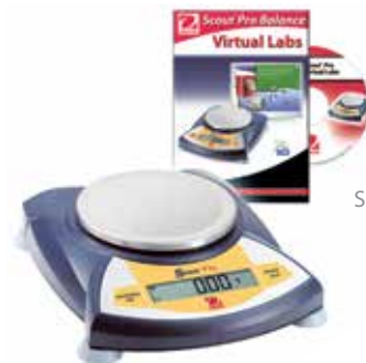
Scout Pro Virtual Lab Bundle