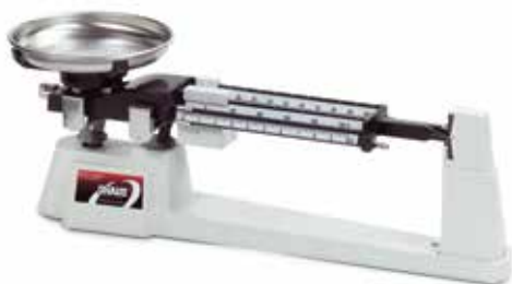
Triple Beam with Stainless Steel Pan (Model 710-00)