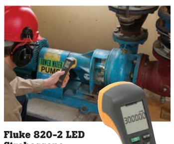
Fluke 820-2 LED Stroboscope Rugged, compact and easy-to-use stop motion diagnostic tool

With the Fluke 820-2 LED Stroboscope, investigate and observe potential mechanism failure with confidence on a variety of machinery, in a wide range of industries, without making physical contact with the machine.