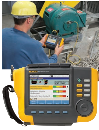
Fluke 810 Vibration Tester Take the advanced vibration expert

The Fluke 805 FC offers frontline mechanical troubleshooting teams a highly reliable and accurate way to check bearings and overall machine health. Instantly upload your data to the Fluke Connect* app and share results—without leaving the field.