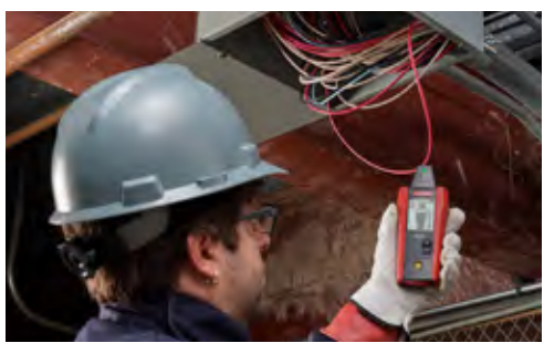
Locate a specific wire