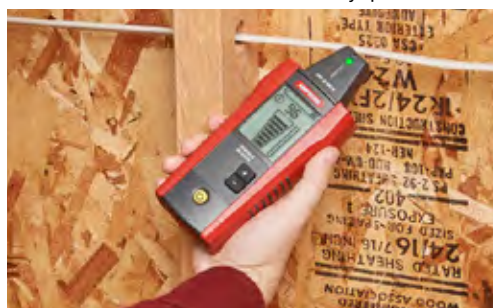
Trace energized and de-energized wires

NOTE: Refer to user manual for accessory specifications