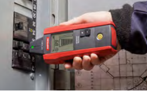
Identify the single correct breaker