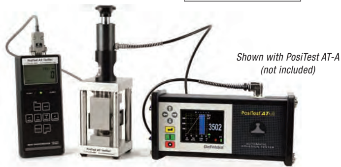
Shown with PosiTest AT-A (not included)

Note: Device displays Imperial units only.