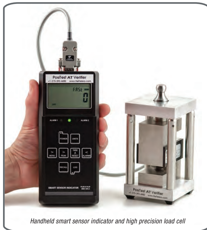
Handheld smart sensor indicator and high precision load cell