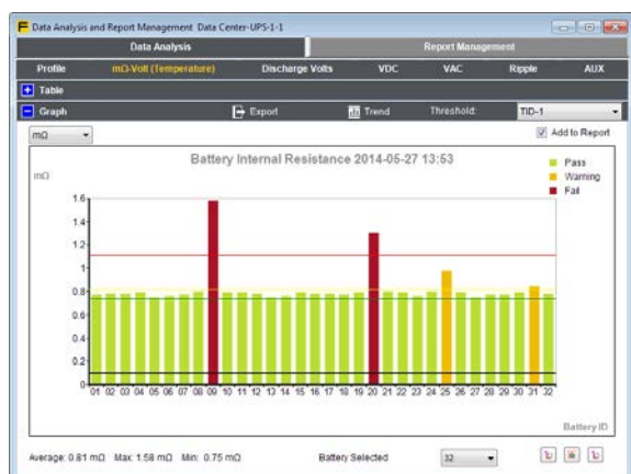
Histogram of a battery string with user defined threshold.