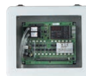
DCT in optional NEMA 4/4X weatherproof enclosure.