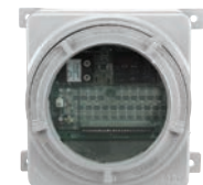
DCT in optional explosion-proof enclosure.