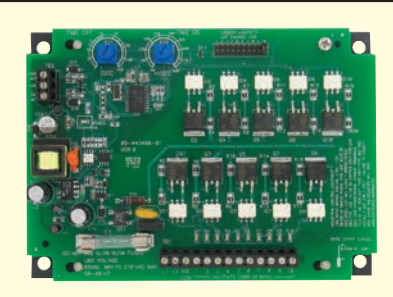
4 thru 10 channel boards