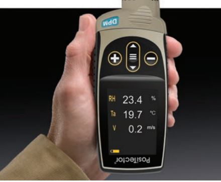
PosiTector DPM A shown with NEW Auto rotating display with Flip Lock.

Hot-wire anemometer with your choice of wind speed measurement units — m/s, km/h, mph, ft/s, ft/m, knots. DPM A models only.