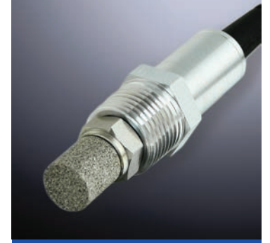
PosiTector DPM D includes ½" NPT threads for insertion into pipes (max 200 psi).