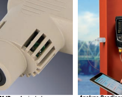
PosiTector DPM IR probe includes a noncontact infrared surface temperature sensor. from anywhere