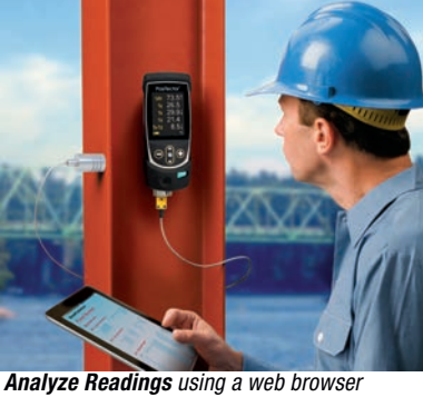
from anywhere – jobsite or head office.