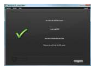
Your logger is now ready for use. Remove from the USB port.

If you would like advice on how best to use the data logger for a particular application, please contact your nearest Lascar representative.