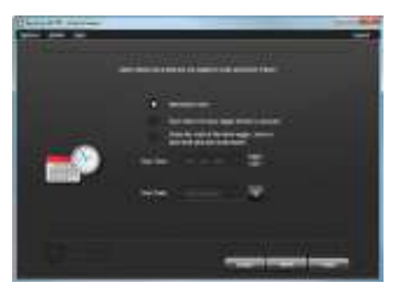
Select when you would like the logging session to start.