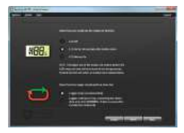
Select how the LCD should function, and what happens when your logger is full.