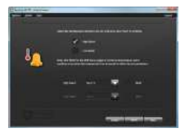
Set high and low alarms if required.