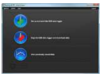
Click on the 'Set up and start the USB data logger' button.