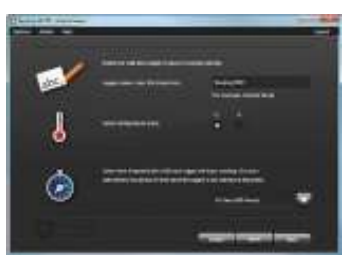
Name your logger and select the logging rate.