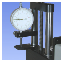
Dial travel indicator