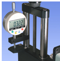
Digital travel indicator