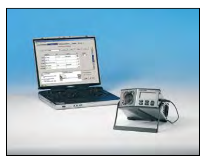
Use the ETC calibrator with JOFRACAL calibration software

The ETC- series has a very easy and straightforward procedure for re-calibration/adjustment. There is no need for a screwdriver or PC software. The only thing you need is a reliable reference thermometer. Place the probe in the calibrator and follow the instructions on the display.