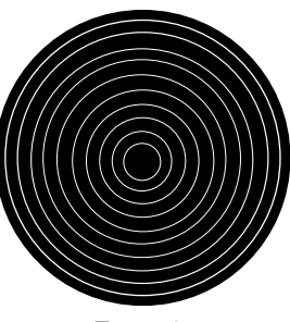
Type 51 ETC-400 R 36 mm (1.4 in) target

NOTE: All ETC400 calibrators are with fixed inserts. They can NOT be changed.