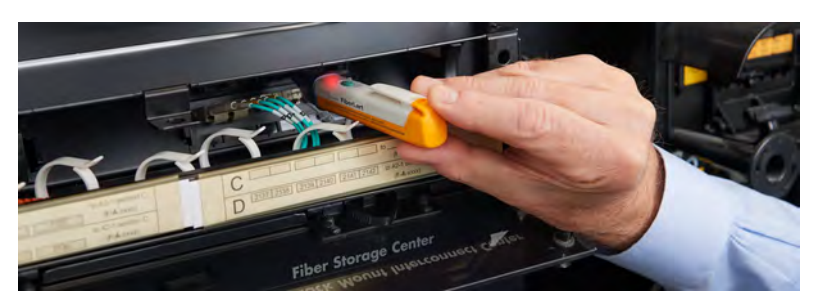
Determine if a port is live. Small size makes it easy to access cramped patch panels.