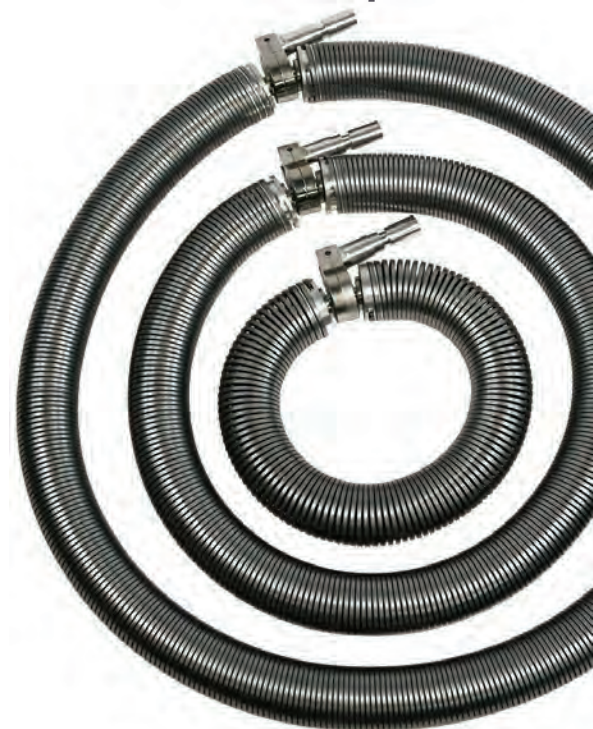
Rolling Spring Electrodes

† The PosiTest HHD is compatible with SPY coils, brushes and accessories.