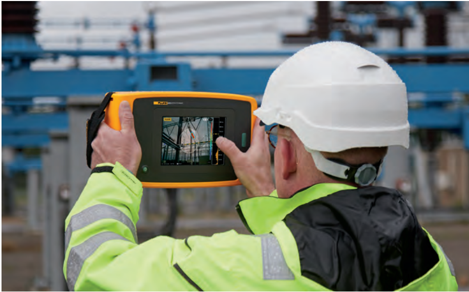
Image taken of the ii910 Precision Acoustic Imager detecting partial discharge in a high voltage application.